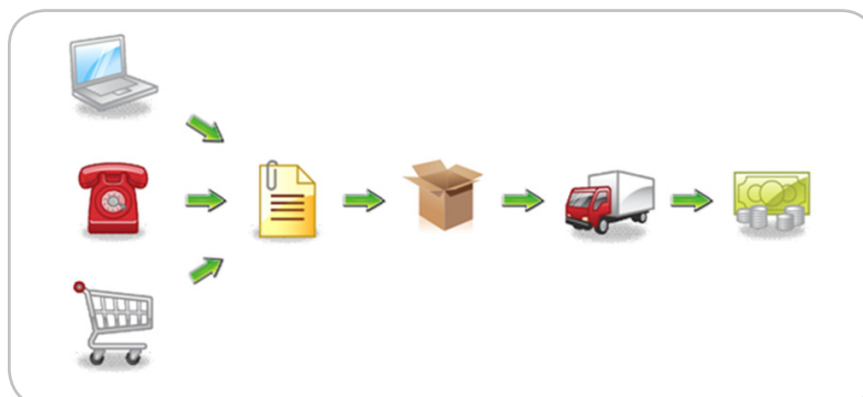
Figure 1. SuitePayments increases efficiencies with NetSuite Order Management.

Whether you're taking payments online via a NetSuite webstore, settling an outstanding invoice with a one-time payment or billing customers on a recurring basis, SuitePayments accommodates all of your payment acceptance needs. As a seamlessly integrated component of NetSuite, SuitePayments gives you updated accounts, inventories and customer records in real time, with full PCI compliance. With SuitePayments, there is no reason to maintain additional processing software or equipment, as NetSuite manages all.