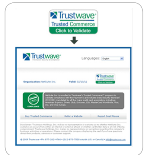
Figure 2. NetSuite is a PCI-compliant service provider.

With SuitePayments, your customer credit card numbers are stored on NetSuite's secure, PCI-compliant systems and servers. Retain all the convenience and levels of customer service as if you had access to full card numbers, but without any of the security concerns.